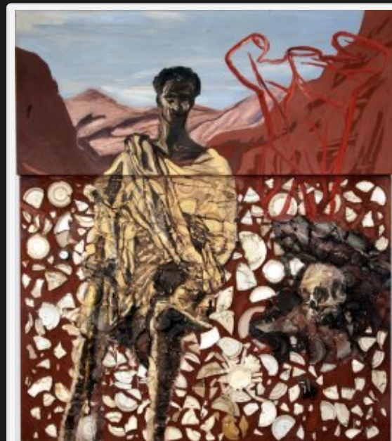
JULIAN SCHNABEL 00526

It was with his first solo show, at the Mary Boone Gallery in 1979, however, that Schnabel would truly come to be regarded as a major new force in the art world. He participated at the Venice Biennale in 1980, and by the mid-1980s had become a major figure in the Neo-expressionism movement. By the time he exhibited his work in a show jointly organized by Boone and Leo Castelli in 1981, he had become firmly established. His now famous "plate paintings"—large-scale paintings set on broken ceramic plates—received a boisterous and critical reception from the art world. A reputation for making brash pronouncements about his importance to the art world - I'm the closest thing to Picasso that you'll see in this *#@ life - engendered contempt from both colleagues and the viewing public. Schnabel is currently represented by The Pace Gallery in New York.